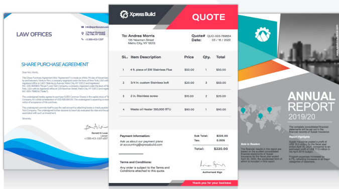
DESIGN & GENERATE